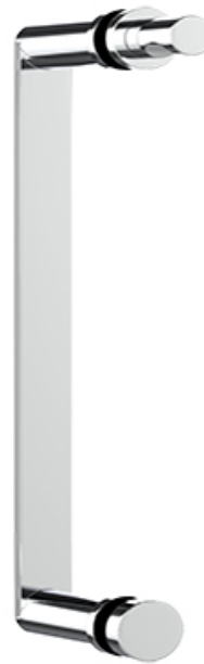
Single Door Handle with Knob shown with a medium Rosette